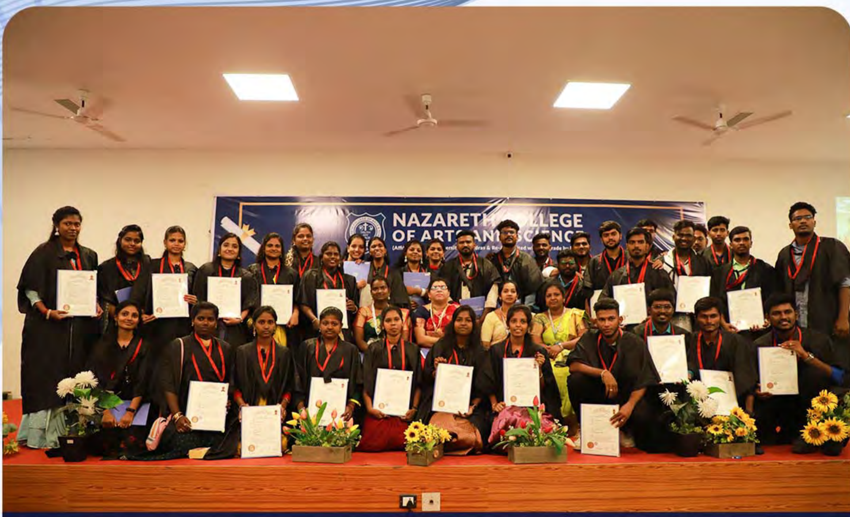
17 th Graduation Day