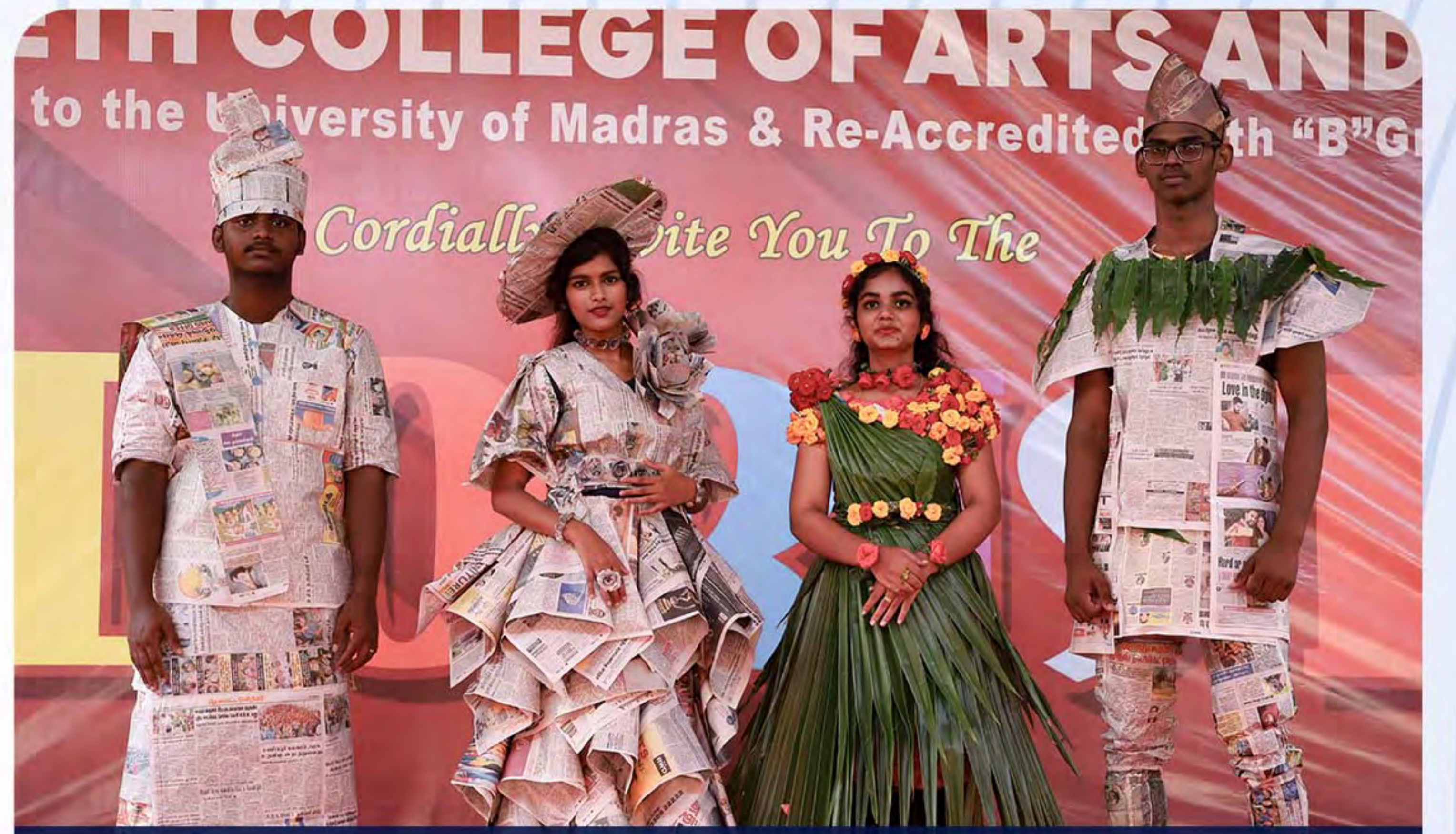
Culturals - Ramp Walk