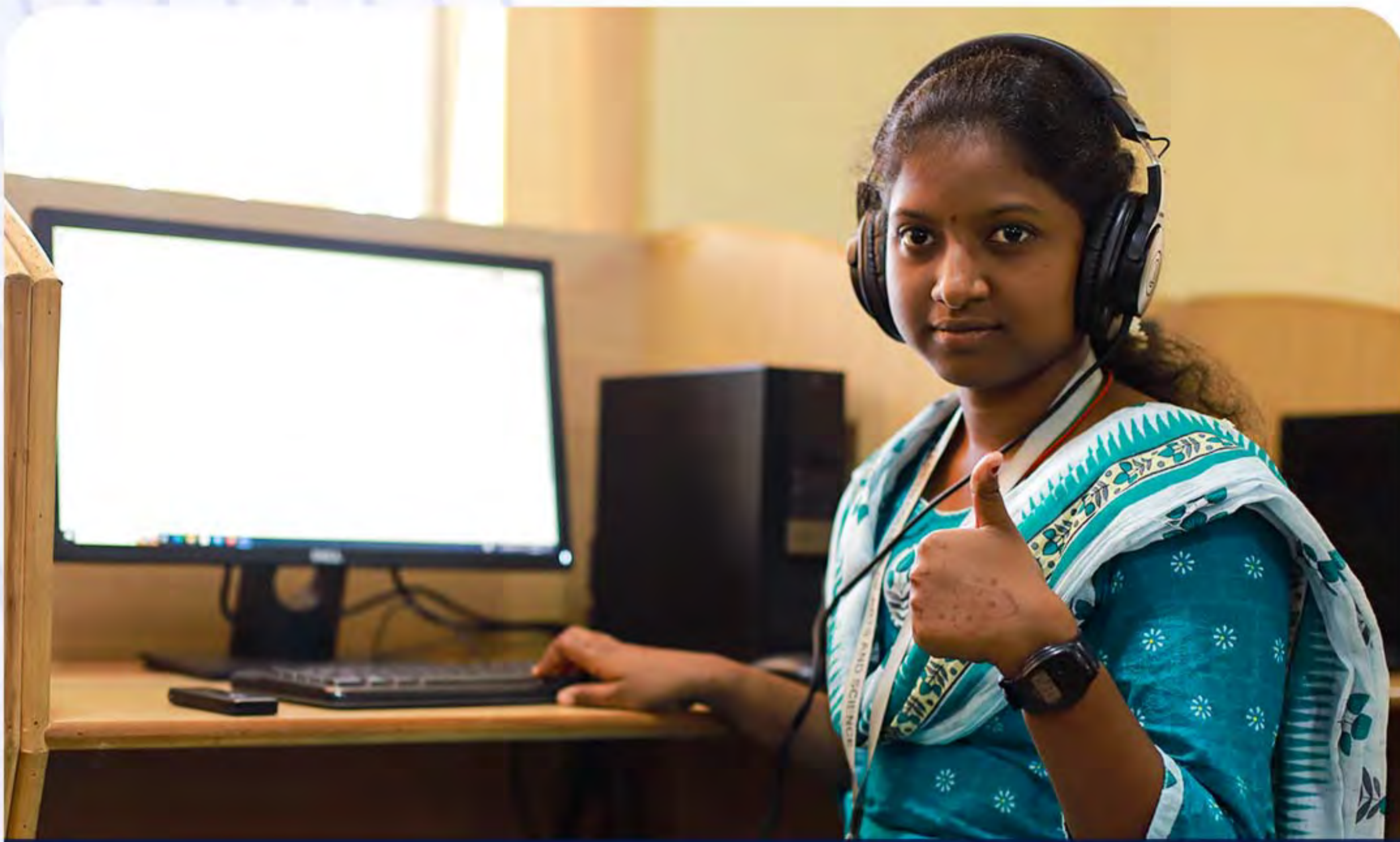
Differently Abled Friendly Campus