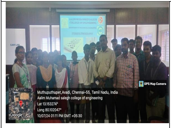
Muthuputhupet, Avadi, Chennai-55, Tamil Nadu, India Aalim Muhamad salegh college of engineering Lat 13.153274° Long 80.102047° 10/07/24 01:11 PM GMT +05:30