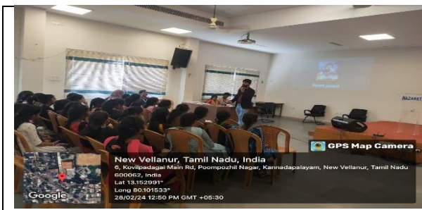
New Vellanur, Tamil Nadu, India 6, Kovilpadagai Main Rd, Poompozhi Nagar, Kannadapalayam, New Vellanur, Tamil Nadu 600062, India Lat 13.1522091° Long 80.101533° 28/02/24 12:50 PM GMT +05:30